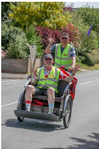
Arriving in Glemsford

They started at Haverhill this morning, went through various villages, Kedington, Hundon, Clare, Cavendish, and were expecting someone to arrive and get on the rickshaw at the farm shop, but no-one turned up! So they came up into the village (the van that was going ahead) and stopped outside here. I sort of volunteered and got on at the Briars. Quite a few people were outside our house, and some on Tye Green, then the school was amazing! The children had been waiting outside for an hour! They cheered and waved flags, I waved the torch, did several turns in the rickshaw up and down past them, they were on both sides of the road. I get tears thinking about it, it was wonderful, such an honour, and a wonderful Suffolk start to the Platinum Jubilee. From Glemsford they were going to Boxted and Hartest, then Lawshall, Lavenham, Long Melford, ending up in Sudbury and starting from there in the morning. The relay will finish on June 1st, they are covering 588 miles. I covered about half a mile!