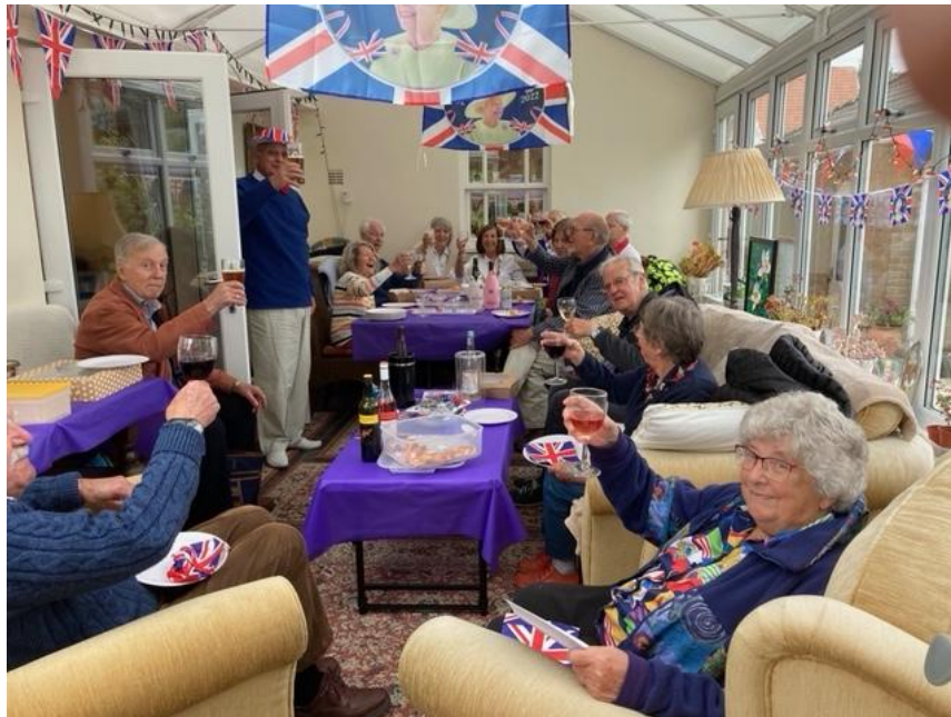
June 6th. The Aftermath. Drying out the bunting!