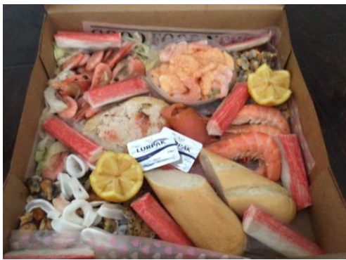
Union Jack picnic / seafood / cream tea boxes available all weekend