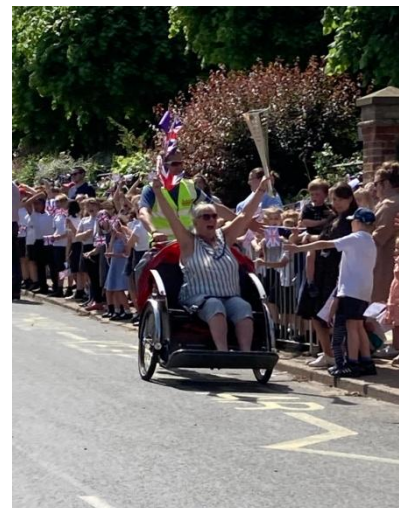
Glemsford Primary School