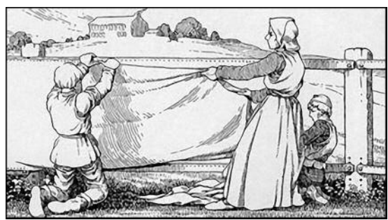
Woe betide the thief who stole a piece of drying cloth, he would be severely punished as a piece could be the equivalent of a week's wages.

The TENTERER would hook up and stretch the cloths outside – in a suitably windy field – to dry and slightly stretch.