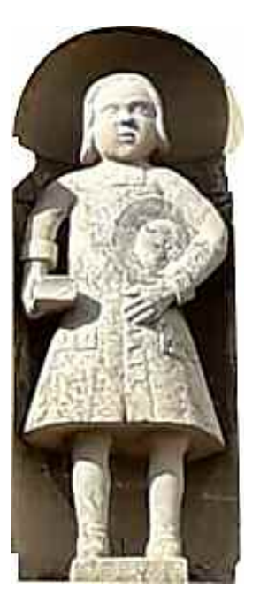
Companion wall niche statue of a boy

Schools, which concentrated on skills, were known as Working Schools where labour occupied the majority of its curriculum. Often the sale of produce helped to further the schools' income. After initial problems or apprehension it was decided that the children should alternate working days with learning days; finally the outcome was hardworking skilled people.