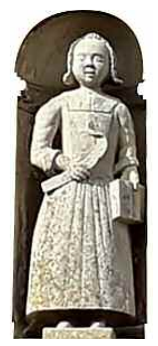
Statue of a girl in wall niche at Burrough Green Charity School

The majority of charity schools were reorganized and new establishments founded at the end of the 17th century, and at an age famed for its moral liberties and with a notorious Royal Court, the ordinary people had little guidance and so the time was ripe for a group of (mainly) clergymen who not only wanted to bring the population back to the moral "fold" but promote hard work and clean living rather than debauchery and profanity. The way to do this was by education; teaching a new generation of the poor and labouring classes.